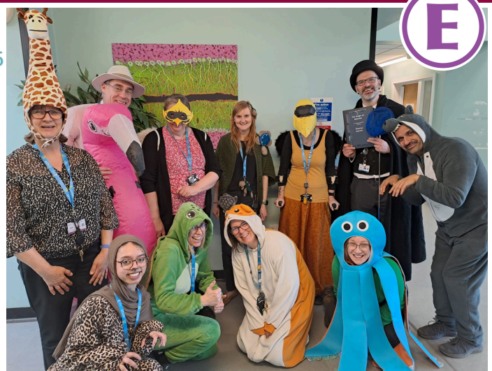
On the Origin of Species, Science Department, World Book Day 2026