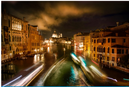
Pupils 'painted' with light in Venice.

Over this autumn term we have seen our department reach new heights! We celebrated our first international department trip to Venice which sparked new ideas, inspiration and a body of primary