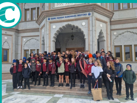
Some of the Year 8s who joined the trip to Bedford