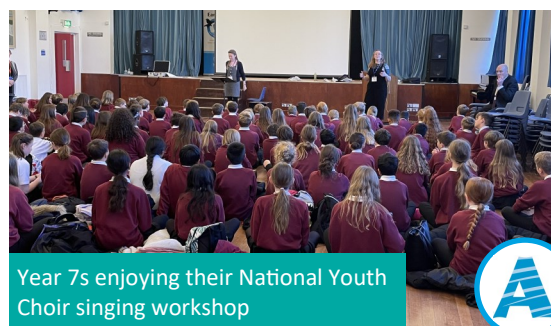
Year 7s enjoying their National Youth Choir singing workshop