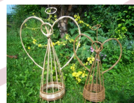
Garden Design is one of the courses on offer.

had an excellent take-up of a wide range of courses, which has been wonderful and feels like a real return to normality. Our recent Saturday workshops were a success and enjoyed by all.