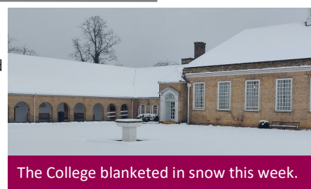
The College blanketed in snow this week.