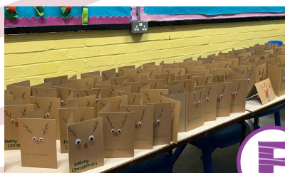
Above: Some of the cards Year 11s made in Business Studies.