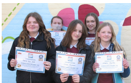
Some of the pupils who entered the competition with their certificates.