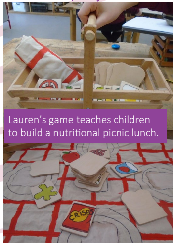
Lauren's game teaches children to build a nutritional picnic lunch.