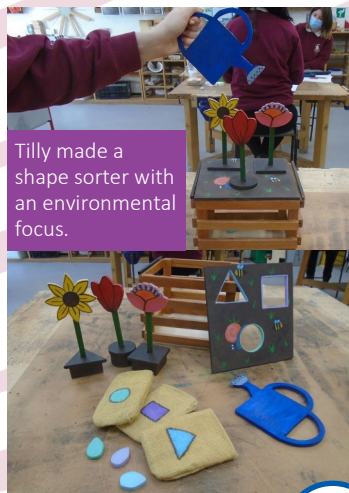
Tilly made a shape sorter with an environmental focus.