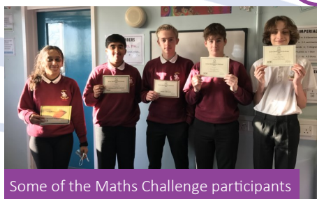
Some of the Maths Challenge participants