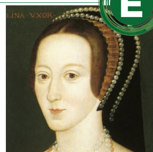
Year 8s: looking at the Reformation through the eyes of Anne Boleyn

We have really enjoyed being back in the classroom learning about History this term. Year 7s have been exploring the Romans, looking at the evidence left behind by the eruption at Pompeii and by exploring some of the stories of migrants from Hadrian's Wall. Year 8s have been looking at the Reformation through the eyes of Anne Boleyn; and considering the role she played in such an important historical event. Year 9s have been exploring the Transatlantic Slave Trade through looking at original sources and accounts to help our pupils analyse the choices and options that slaves had. We are excited to see the outcomes of their learning in their first milestones this year.