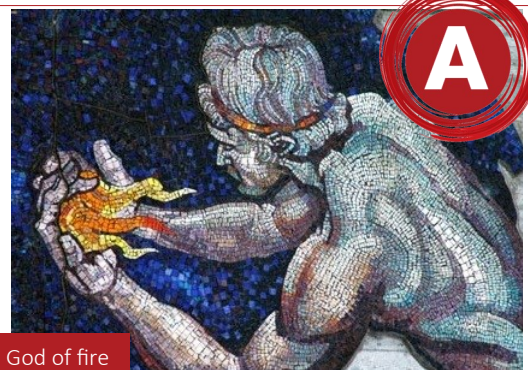
Prometheus, a Titan God of fire