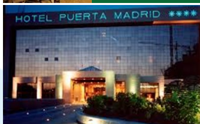
HOTEL PUERTA MADRID ****