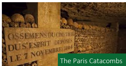
The Paris Catacombs

We may not be able to travel much due to all the restrictions in place at the moment but, in Languages, this doesn't stop us from finding out about foreign countries! This half-term, Year 8 French are completing a module on travelling to Paris and have been finding out about the main landmarks, from the Eiffel Tower to the lesser-known catacombs. Meanwhile, Year 10 Spanish have just furthered their knowledge of holiday vocabulary and have weighed up the pros and cons of different types of accommodation. They have also practised booking a room in a Spanish-speaking hotel and had fun learning the vocabulary of complaints, should they have some unpleasant surprises in their room.