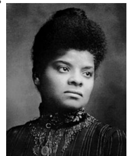
Ida Wells, early Civil Rights campaigner