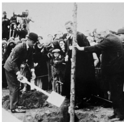
The Princes of Wales plants a tree at the opening

As you will be aware, Sawston Village College is celebrating its 90th year, and each pupil has been given a commemorative booklet with space for them to write their own contributions. In English lessons this week, pupils were able to reflect upon and add their own happy memories of the school and what they will take away from it. Be it friendships, winning hockey matches or learning another language, pupils wrote fondly about what Sawston means to them,