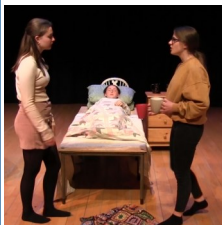
Year 11s in 'Skirmishes'

Once again, our committed Year 11 actors have impressed us with their excellent performances. Extracts from a full range of weighty texts from 'Memory of Water' and 'Skirmishes' to the brilliantly farcical 'Odd Couple' and 'The Importance of Being Earnest' have been rehearsed, blocked, directed and performed for camera in closed studio conditions. This is a far cry from our traditional evening of theatre for family and friends, but our GCSE pupils devoted the same focus, the same determination and the same hard graft that leads to well-crafted, controlled and truthful performances.