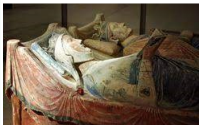
Eleanor of Aquitaine is buried at Fontevraud Abbey

It has been a very exciting return for both teachers and pupils in History. As our wider aim this year in the History department is to start to improve the diversity of the curriculum, we are teaching some new topics for the first time this year: in both Year 7 and 8 we have introduced new enquiries.