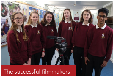
The successful filmmakers