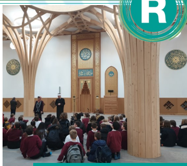
The new mosque is eco-friendly.

Year 7 pupils had an opportunity to visit the new mosque in Cambridge, the first eco-friendly mosque in Europe. Upon arrival, pupils were welcomed into the Islamic garden, where they learned about the sustainability of the mosque and its unique design features. We were then taken on a tour, had the privilege of meeting with the Imam and were able to ask questions and explore what we have been learning in class in more detail. The pupils were outstanding during the visit, conducting themselves in a respectful and inquisitive manner.