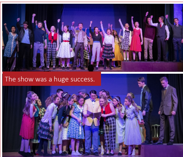
The show was a huge success.