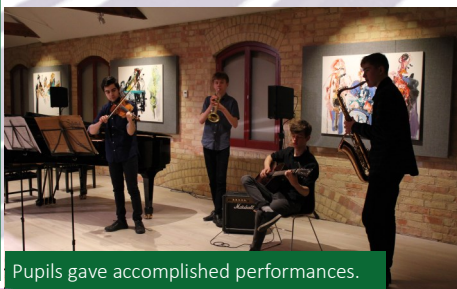
Pupils gave accomplished performances.