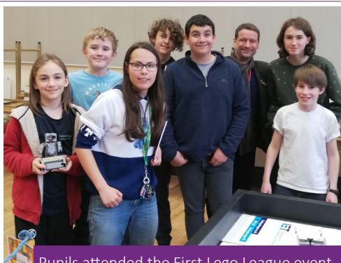
Pupils attended the First Lego League event.