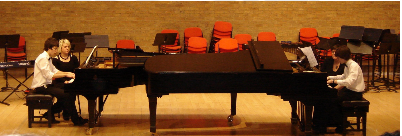
Tom (left) and Declan Corr (right) (also an SVC alumnus) performing at West Road Concert Hall in the school concert in 2008.